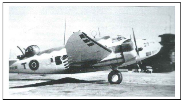
Right: The damaged plane, notice the upturned wing tips